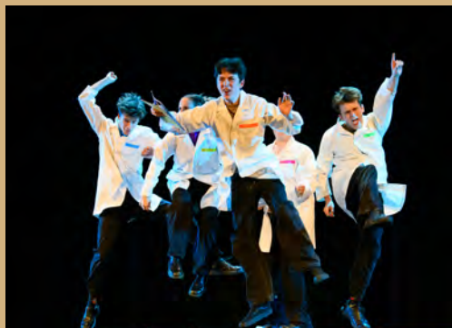
Science for Dummies